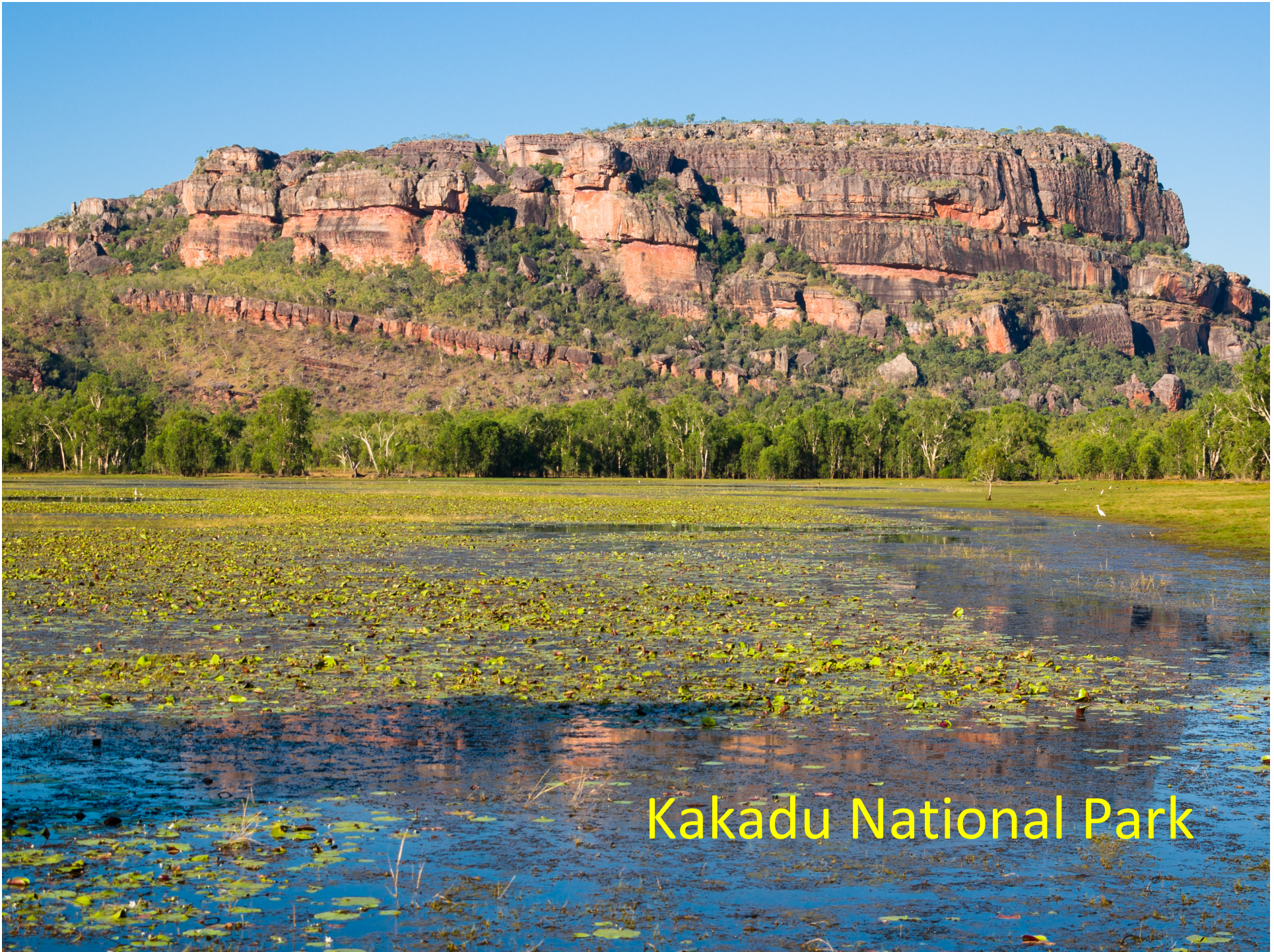
Kakadu National Park